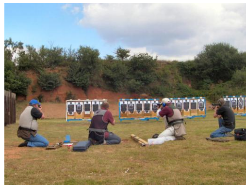
Derby V Derby goes sitting