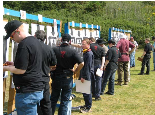
The LCB Marksmen were there too