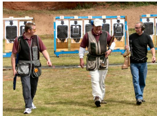
A grand day out!