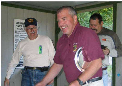
Second in A Class