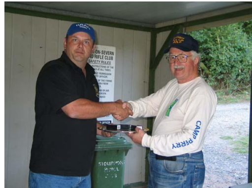
A well deserved first in Small-bore

ELEY sponsored the Event by giving everyone a goody bag and additional items for the prize table