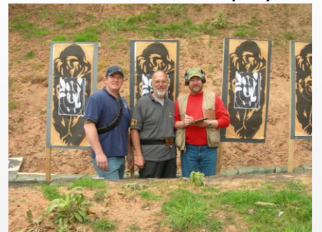
Friendly Range Crew