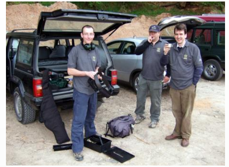
New shirts on display