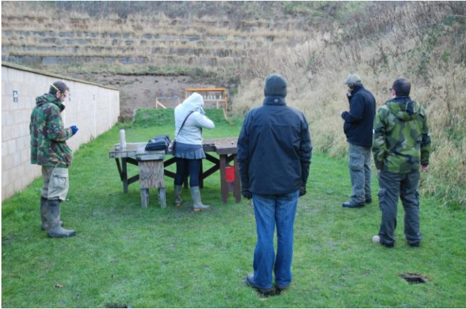
There was plenty of advice (barracking)