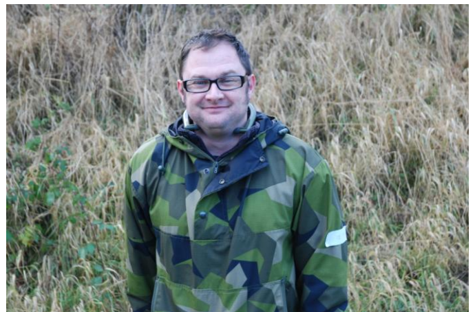
Then James crushed him!