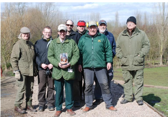
Some of the competitors, others had sneaked off for an early lunch