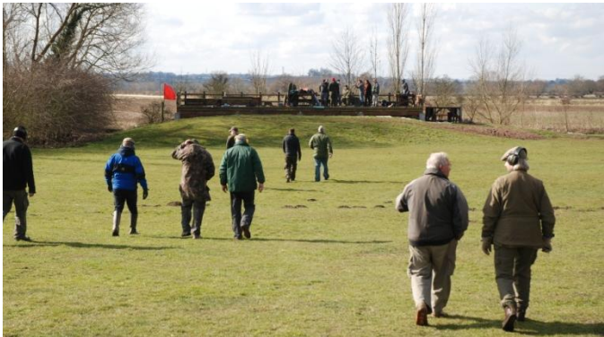
Plenty to talk about on the way back