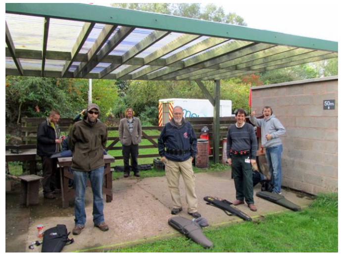
Eager to make a start