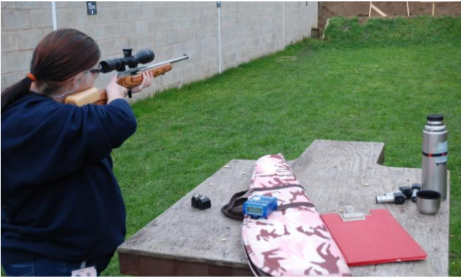
Joy was slow but accurate