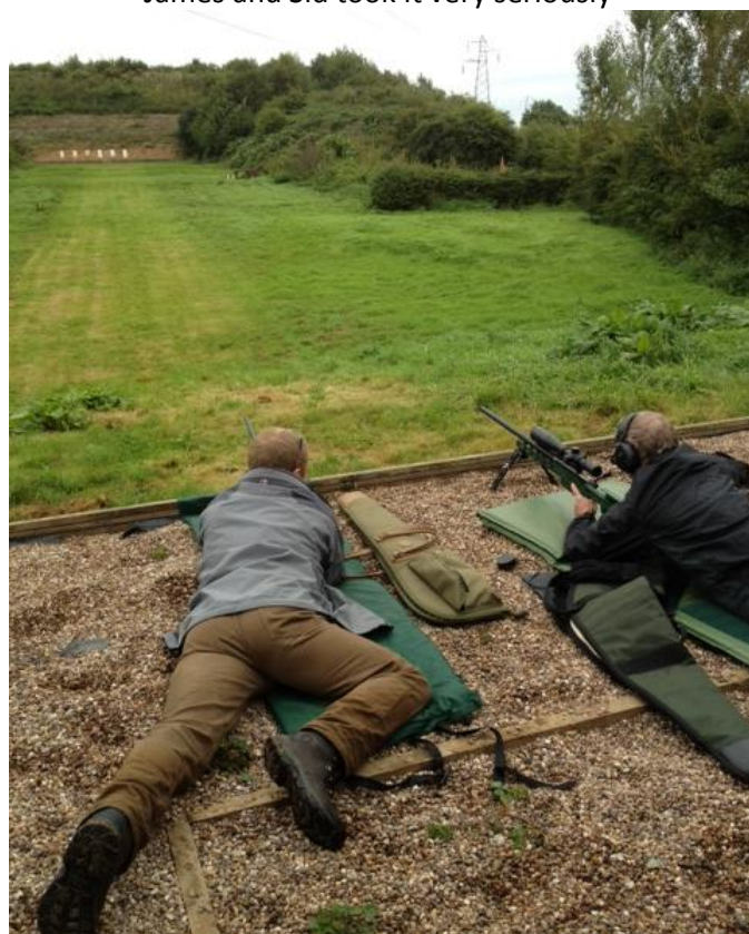
That looks a long way!