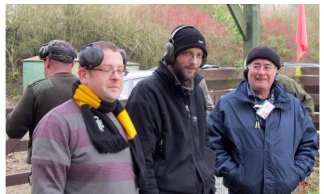
The Competition Officer looking cold!