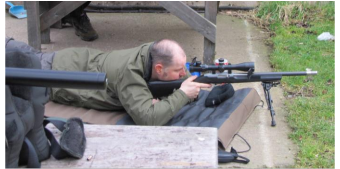
The winner looking very steady

The Mini McQueen competition was shot at scaled down McQueen targets at 50 yards. 4 Strings of 5 shots fired in 15 seconds at five individual targets from the prone position using a bipod. The old, bold, lame and lazy could use a bench to shoot from