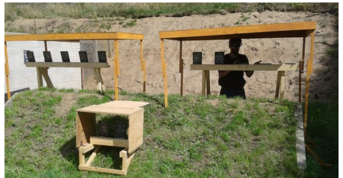
Tim resets the plates