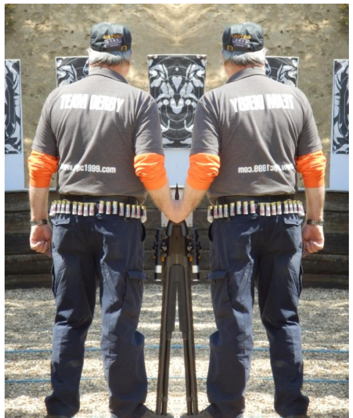
TWO Bobs!! Ones bad enough