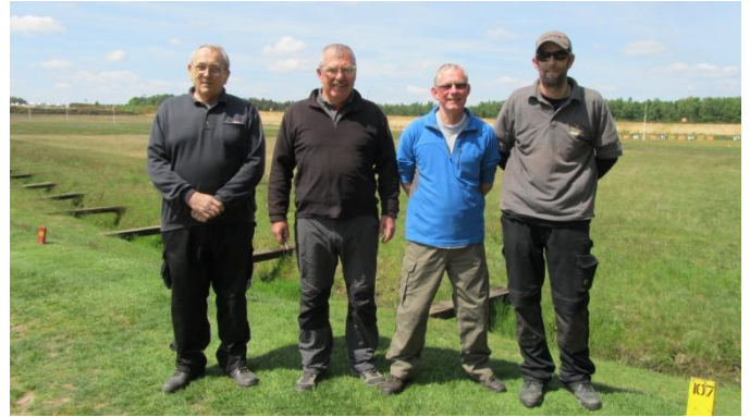
The Sporting Rifle team