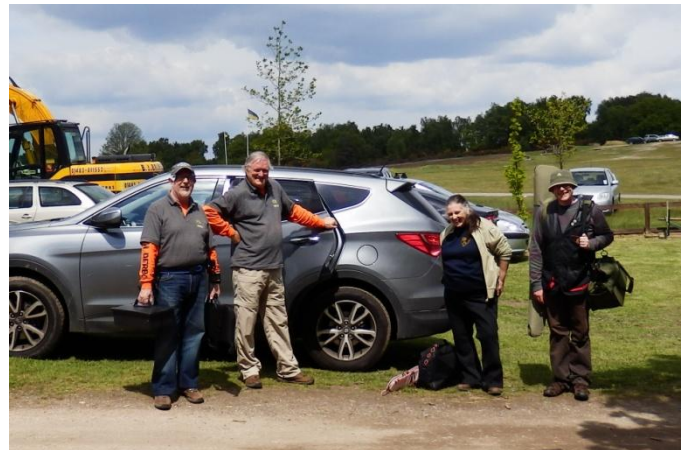
Another hard day at the office