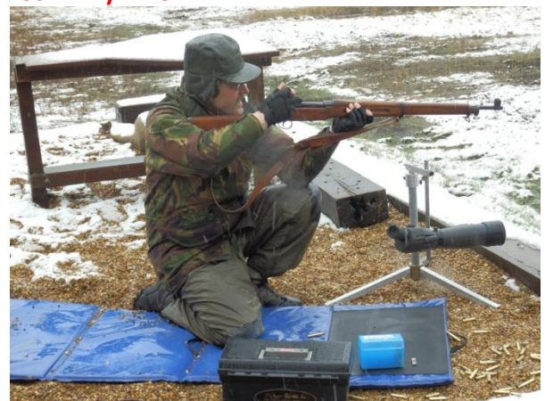
It's the same course of fire for SMLEs too