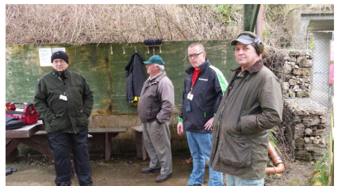
Queuing up for the start