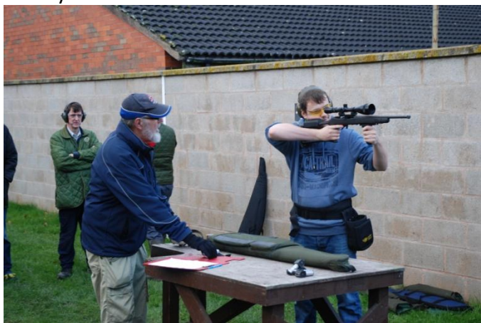
Rob shot well and led of a while