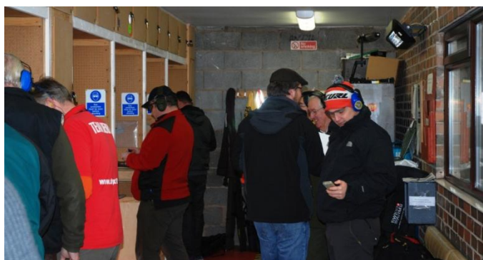
It was busy on A range