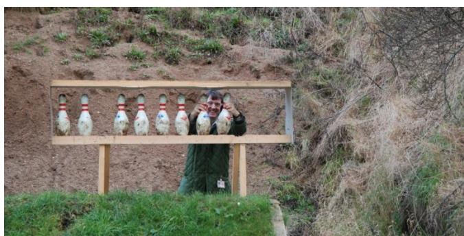
Paul seemed to be in constant reset mode