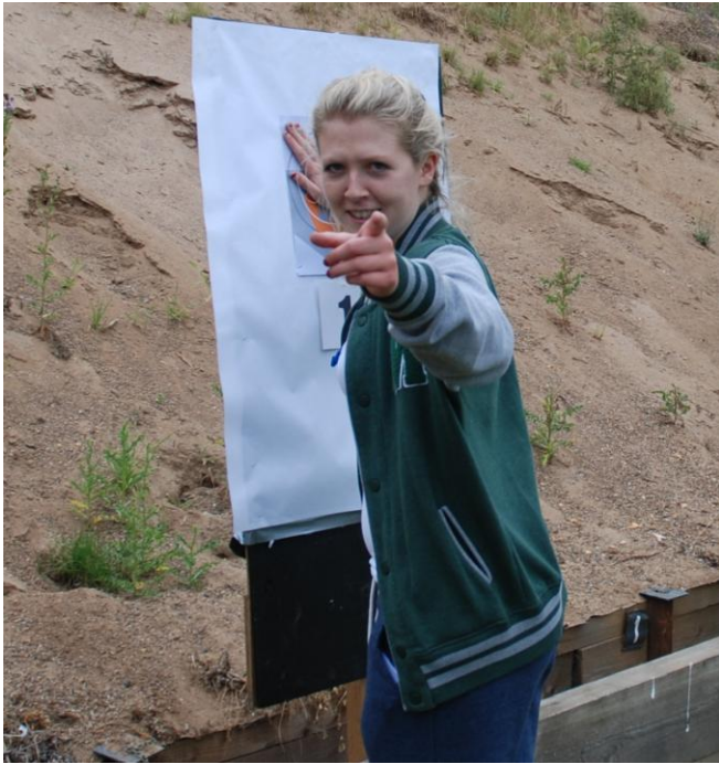
Last year's winner wanted no publicity