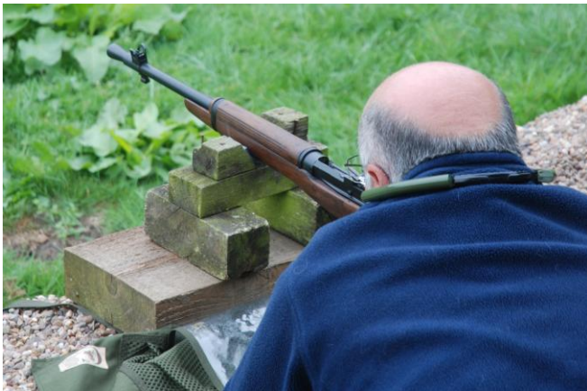
Never going to win – but great fun