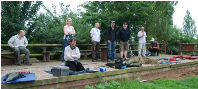
Ready and waiting for the off