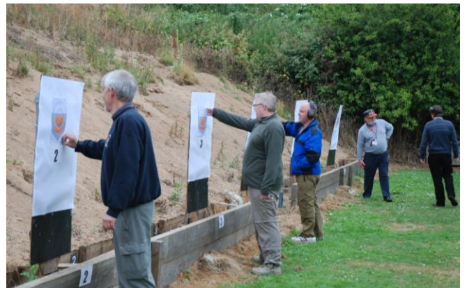
The moment of truth