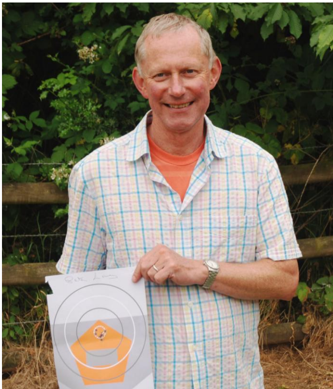
You can't do much better than that