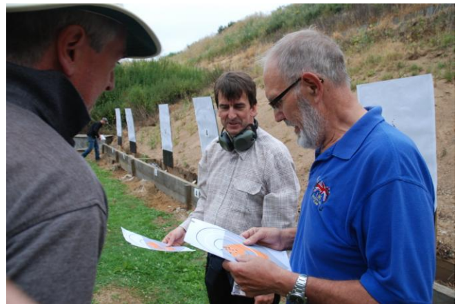
Not bad – but not good enough