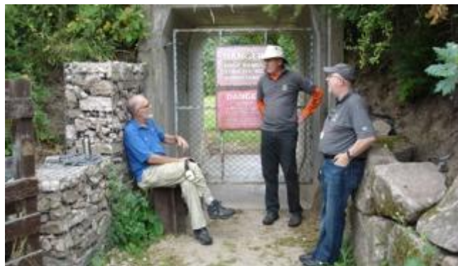
Hard work running the timer